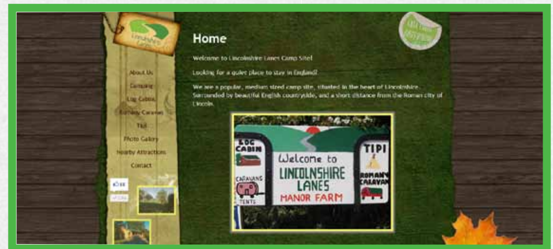
Example Screenshot Of Lincolnshire Lanes Website