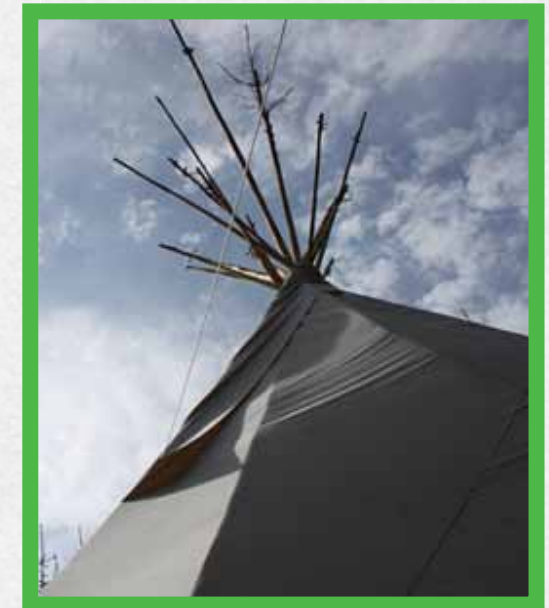
Photo Of The 2011 Tipi