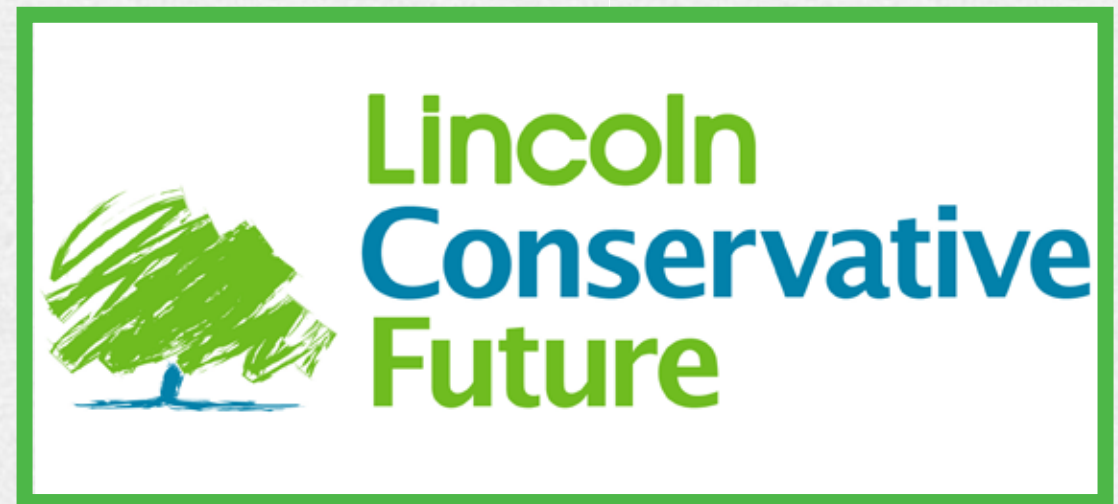
Lincoln Branch CF Logo