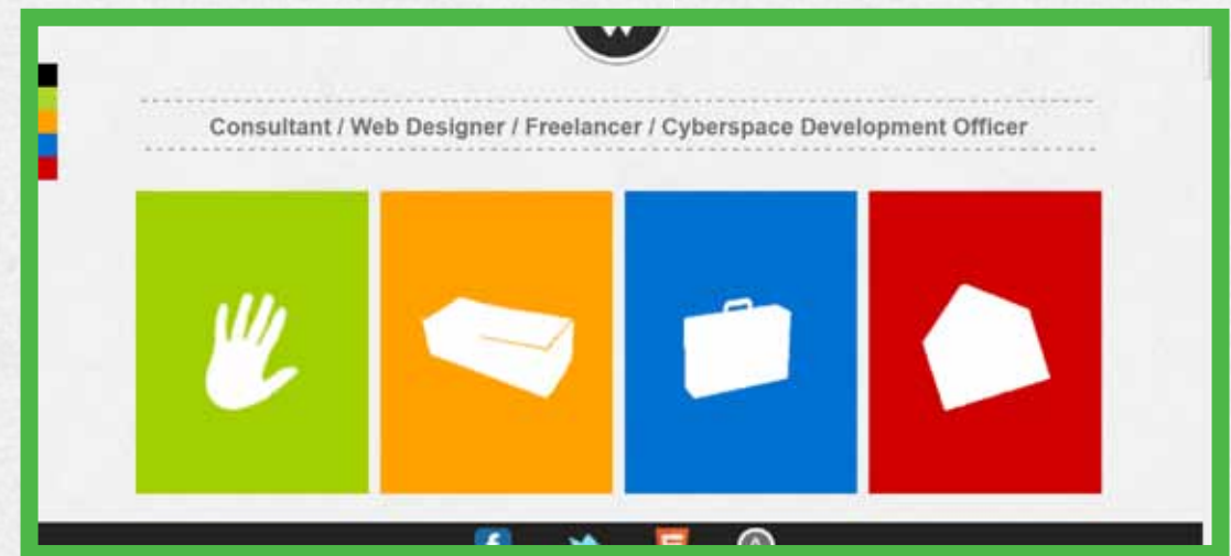
Main screen of waynecovell.co.uk, with navigation buttons